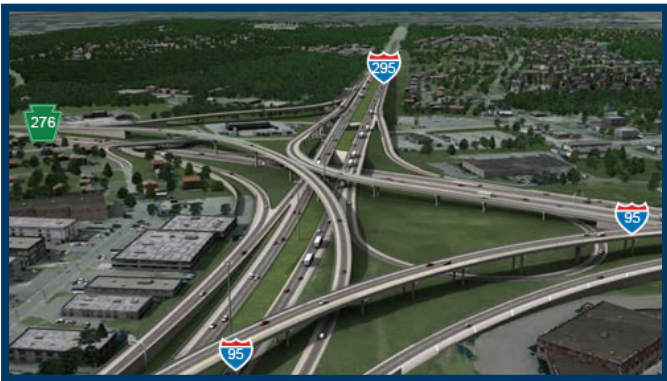
PA Turnpike / I-95 Interchange Project Recently Completed

2530 Pearl Buck Road is located within the Keystone Industrial Park directly off of Exit 40 along the I-95 corridor and is approximately 5 miles away from I-276 (PA Turnpike). The property is within close proximity to major population centers, locally and regionally, such as Philadelphia (20 miles), New York City (75 miles), and Washington D.C. (157 miles). In addition to this, the Lower Bucks Submarket is known for its strong labor pool and offers key logistical amenities such as close proximity to FedEx, UPS, the Philadelphia International Airport and public transportation. Other significant distribution operations that call Lower Bucks County home include Kmart, Rite Aid, Estee Lauder, Staples and Airgas.