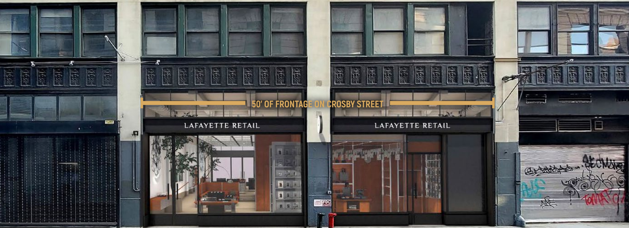
Crosby Street Storefront