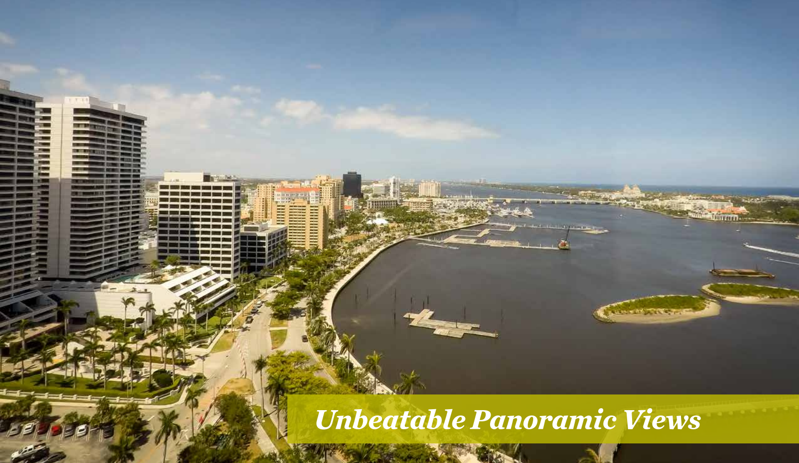
Unbeatable Panoramic Views