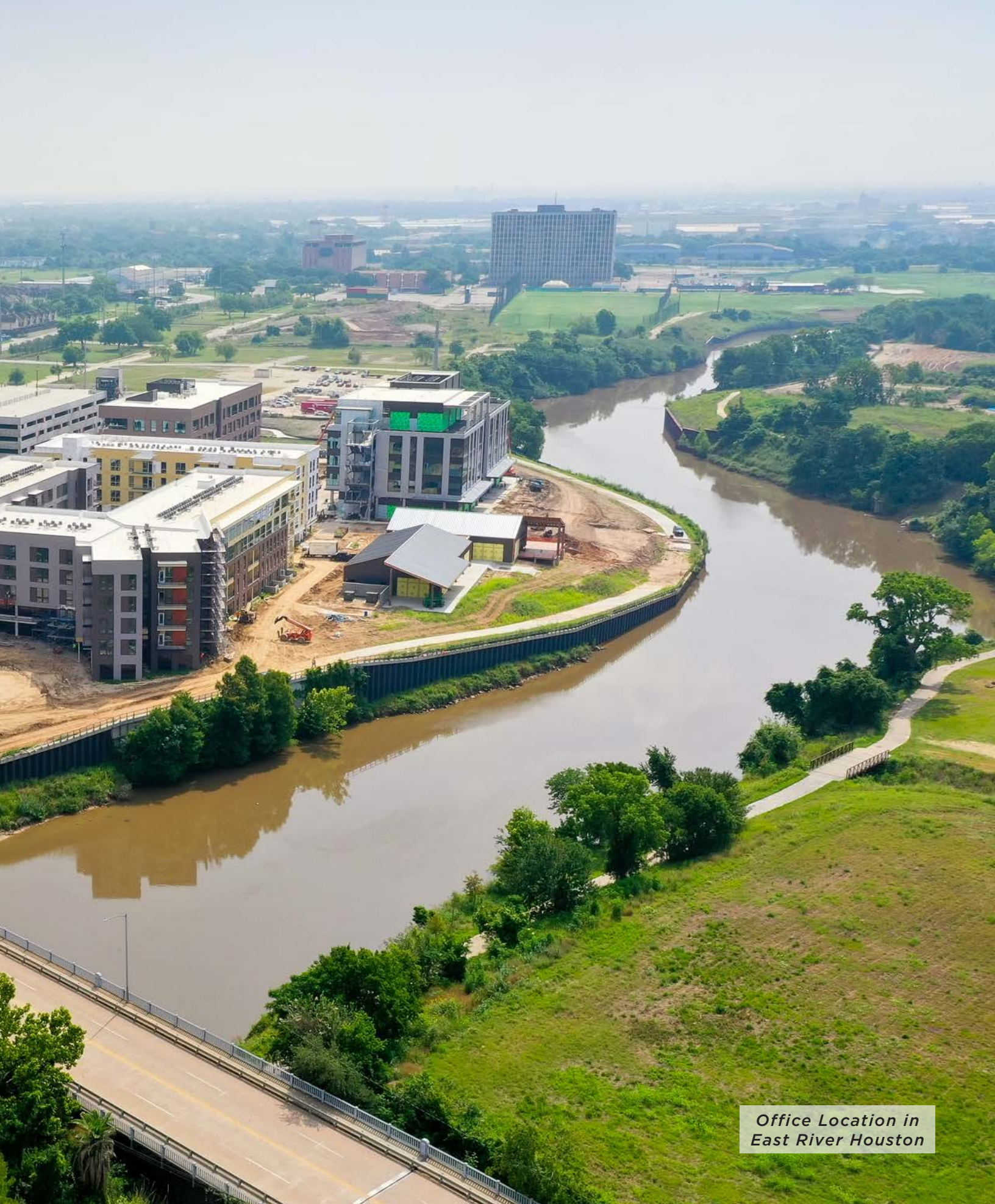
Office Location in East River Houston