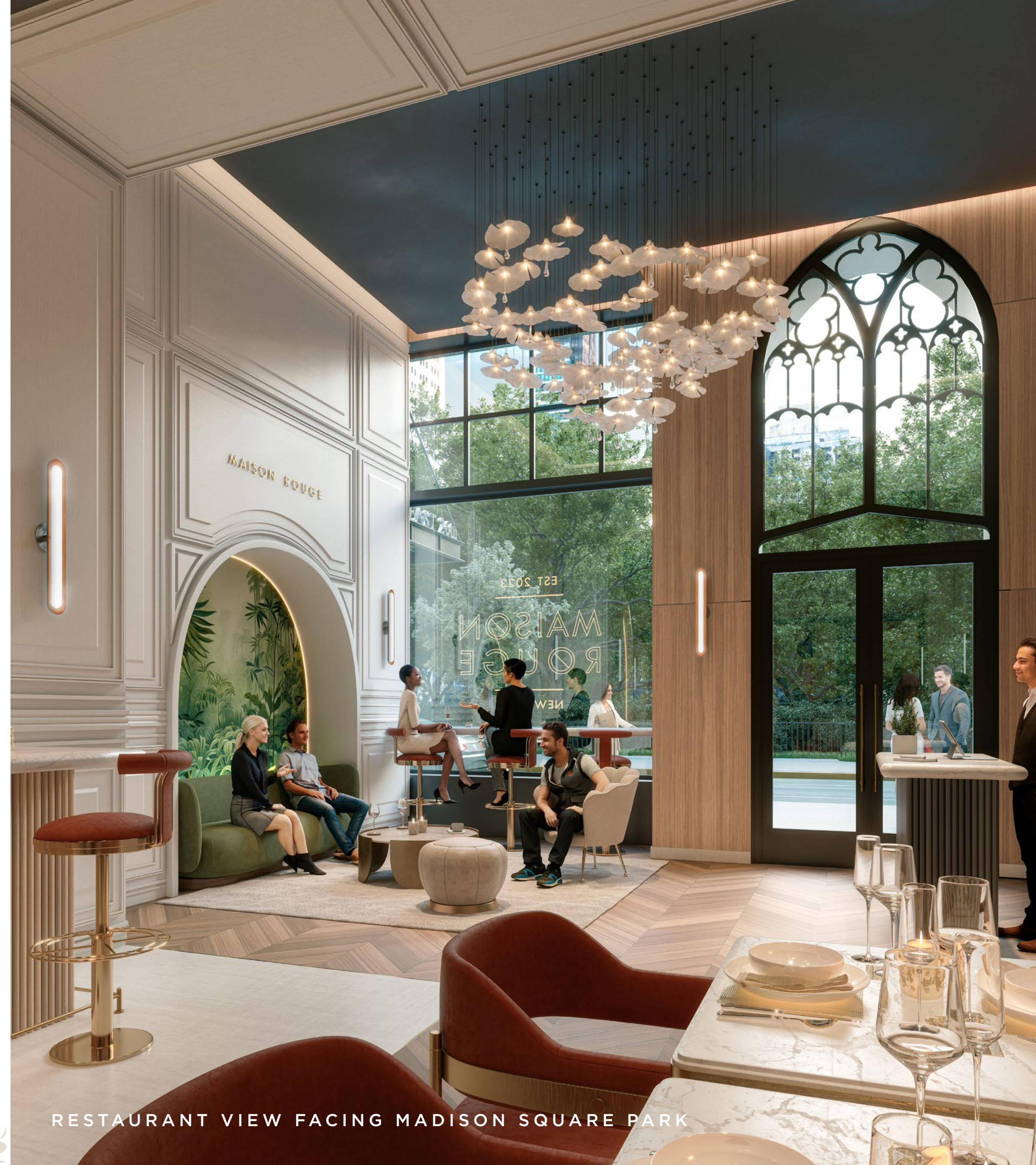
RESTAURANT VIEW FACING MADISON SQUARE PARK