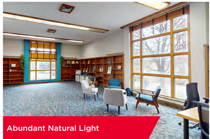
Abundant Natural Light