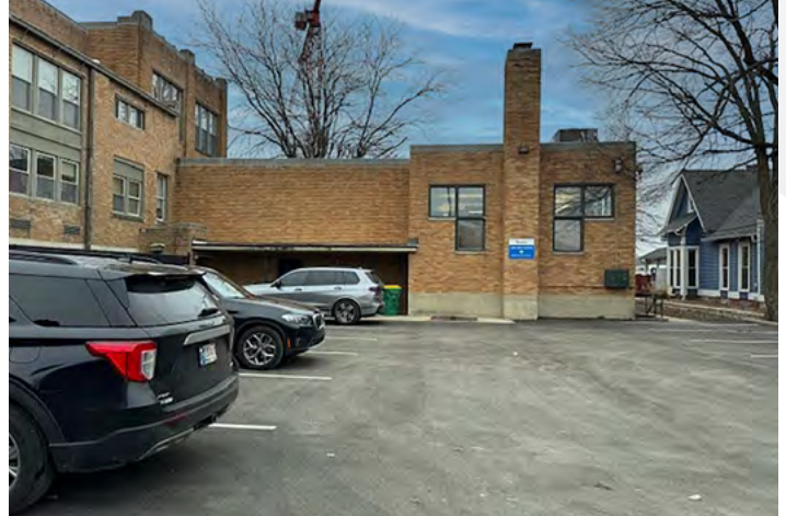
16 Dedicated auto parking spaces