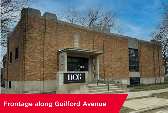
Frontage along Guilford Avenue