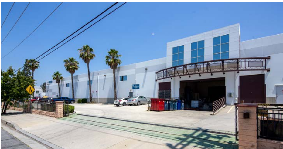
BUILDING FRONT - LOADING BAY