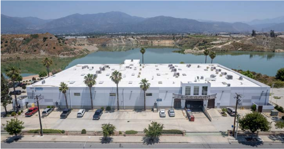
AERIAL - BUILDING FRONT, VIEW NORTHEAST