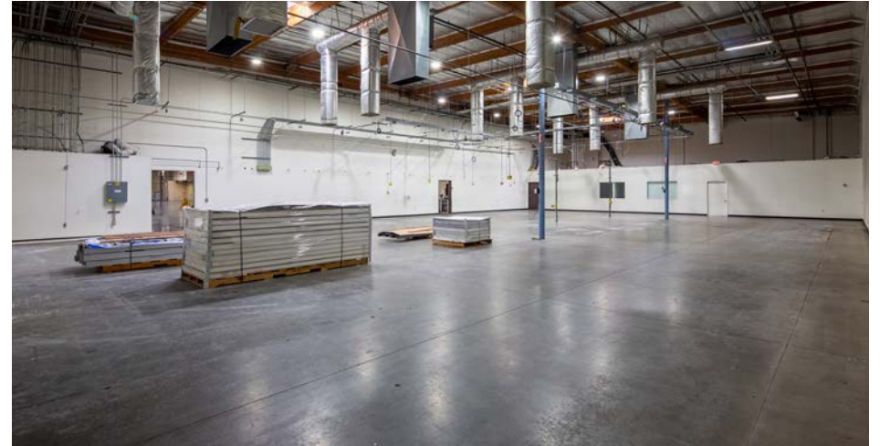
TEMPERATURE CONTROLLED WAREHOUSE