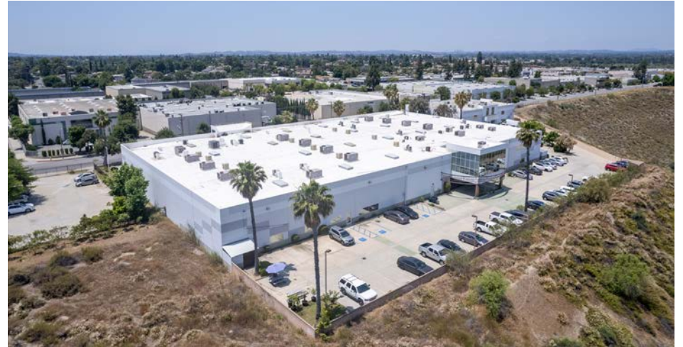
AERIAL - BUILDING REAR, VIEW WEST