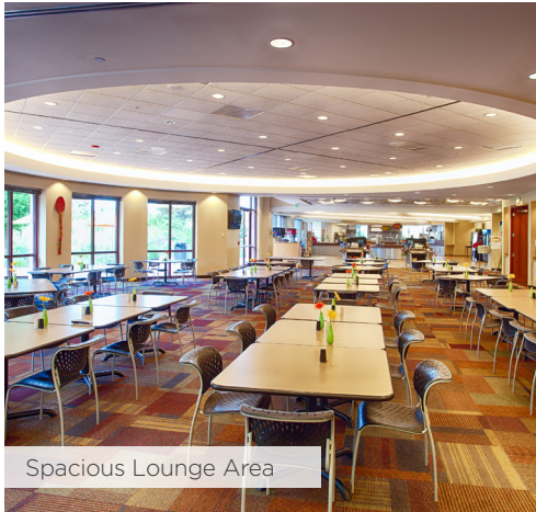
Spacious Lounge Area