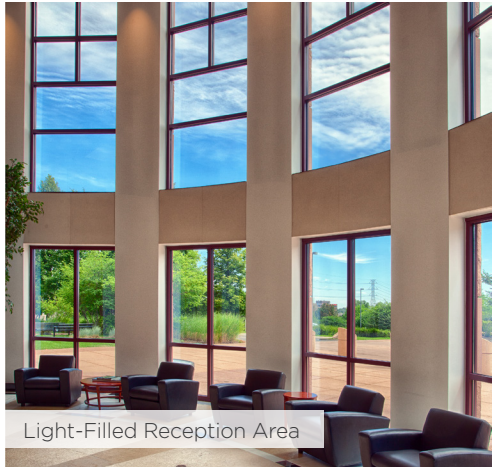
Light-Filled Reception Area