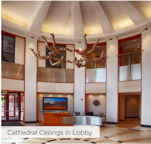
Cathedral Ceilings in Lobby