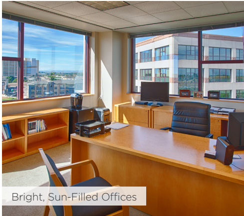
Bright, Sun-Filled Offices