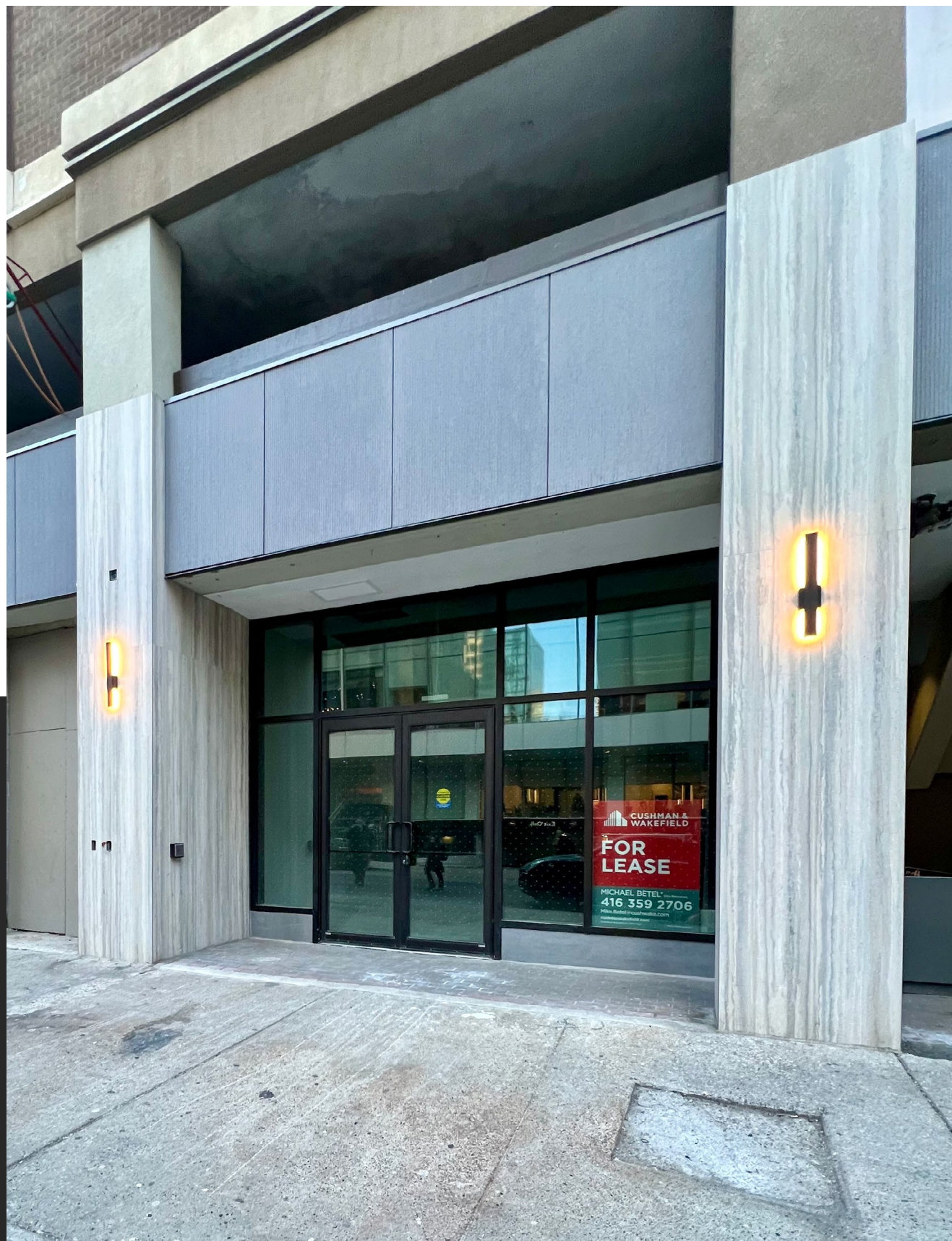
Balmuto Street Frontage