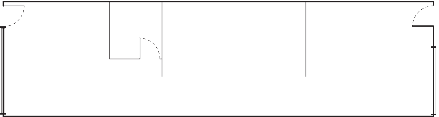
Floor plan not to scale

Ted Eyre Senior Vice President +1 650 320 0216 ted.eyre@cushwake.com LIC #00897564