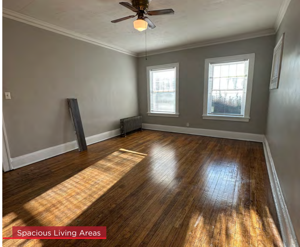
Spacious Living Areas