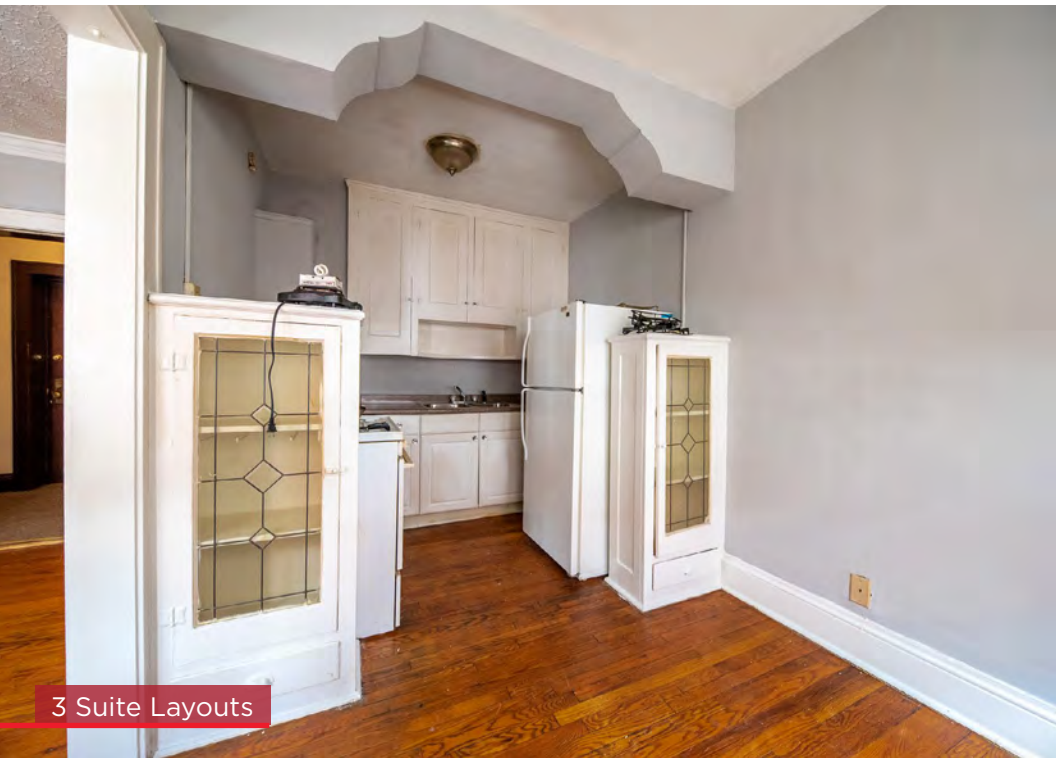
3 Suite Layouts