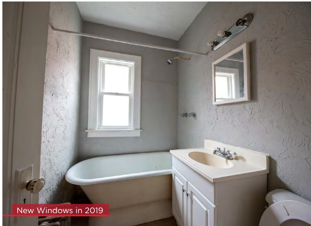
New Windows in 2019