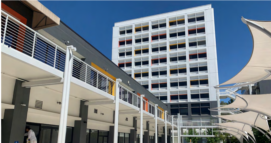
PHOTO GALLERY- COMMON AREA