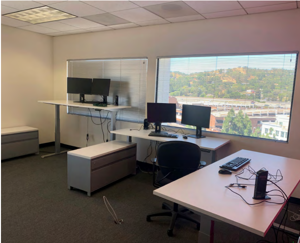
PHOTO GALLERY-SUITE & AMENITIES CENTER