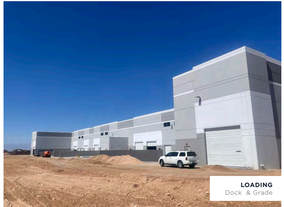
LOADING Dock & Grade