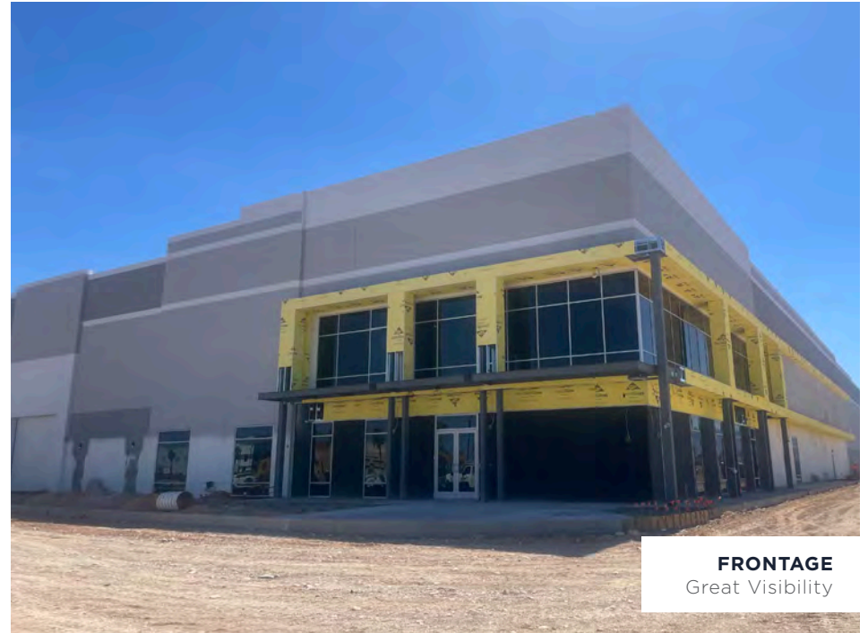
FRONTAGE Great Visibility