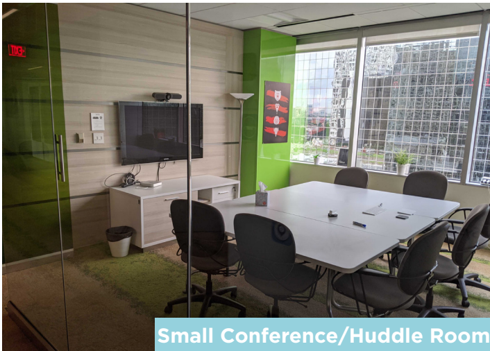
Small Conference/Huddle Room