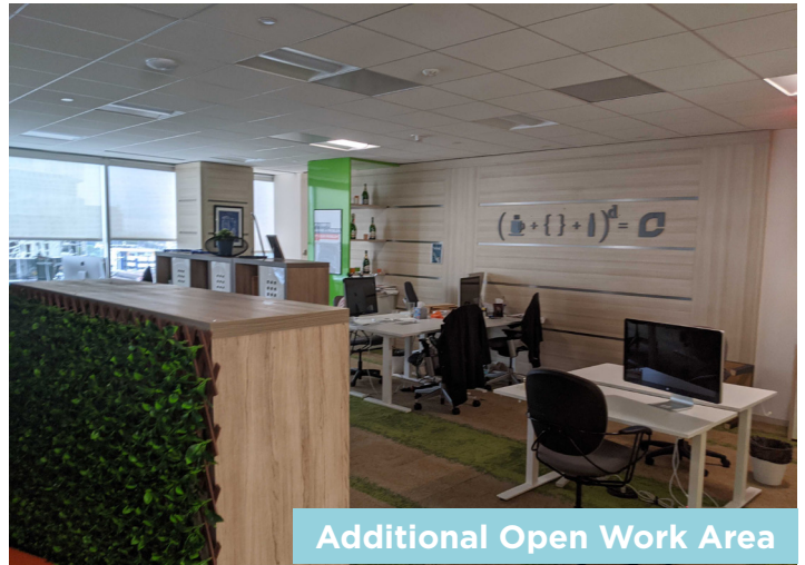
Additional Open Work Area