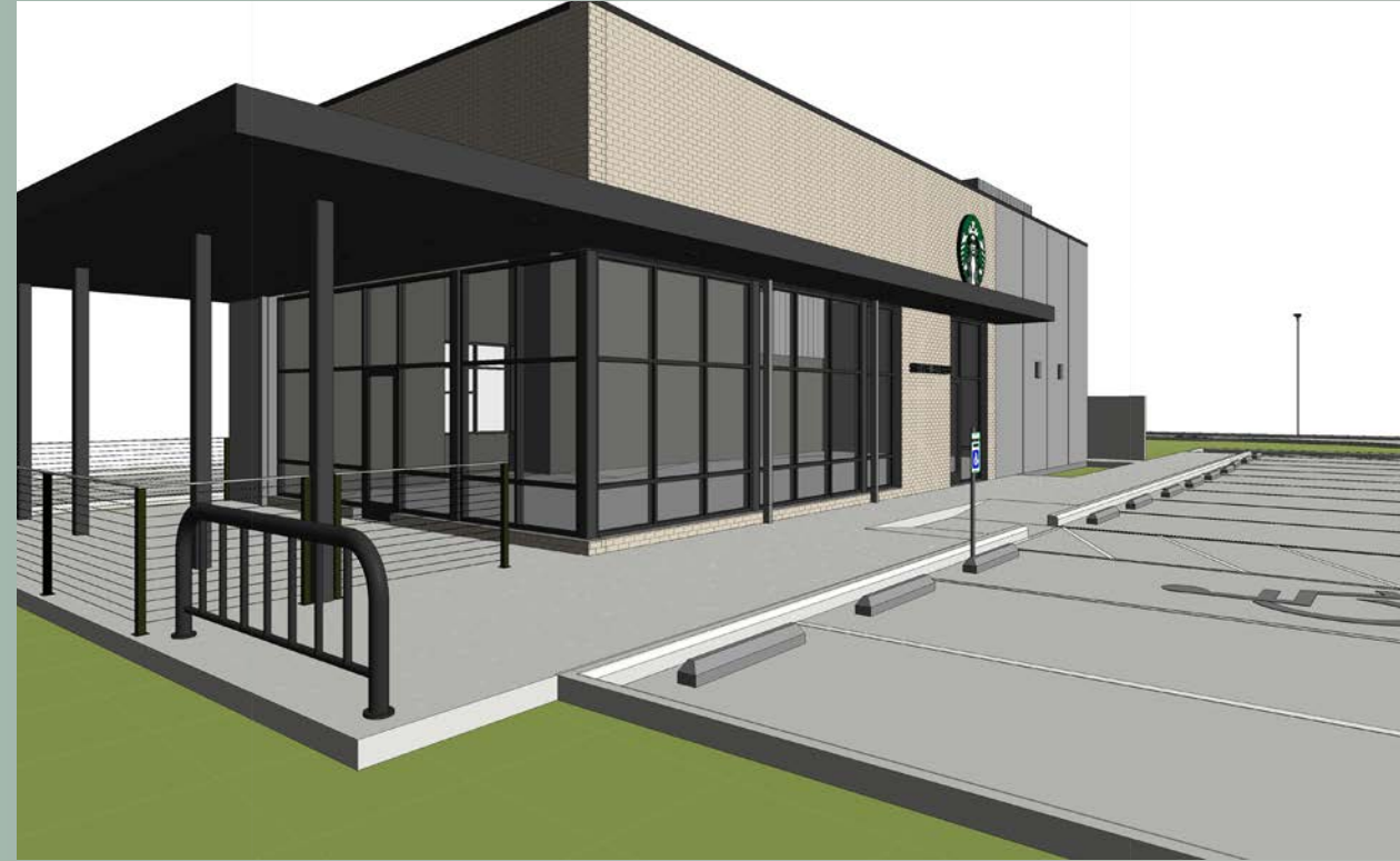
ACTUAL SITE RENDERINGS