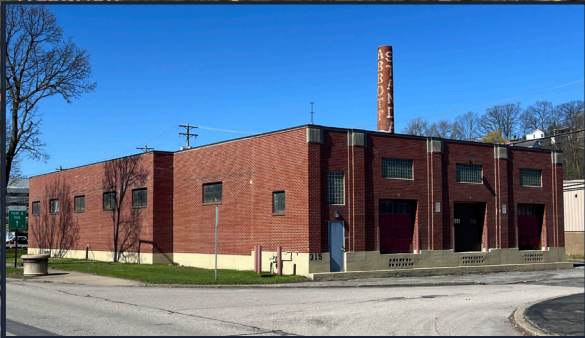
315 MANSFIELD BOULEVARD

Located moments from Downtown Carnegie restaurants and only half mile from I-376 and I-79 Carnegie Exit.