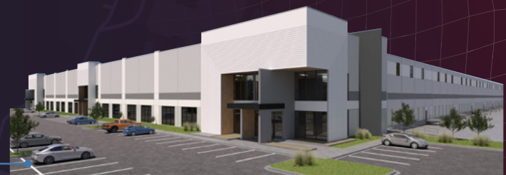
INNOVATION LOGISTICS CENTER