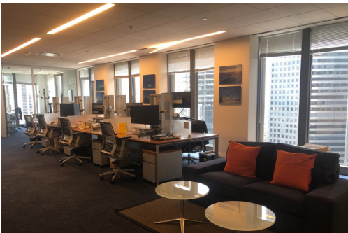
OFFICE BULL PEN