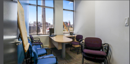
Two private offices facing Orange Lane