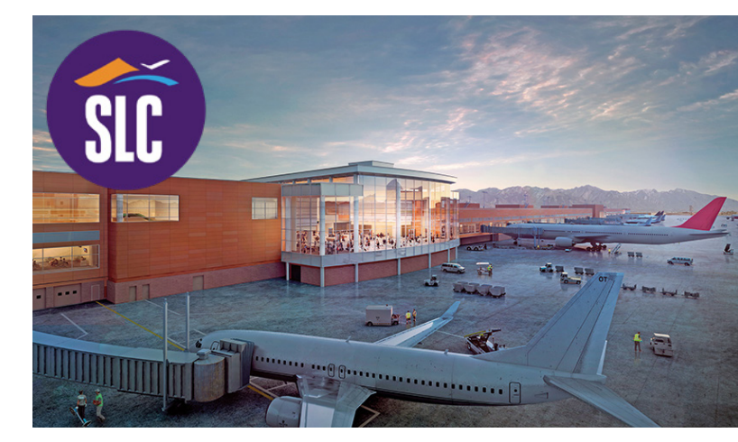
Phase 1 & 2 of the $4 billion Salt Lake City International Airport expansion now open.