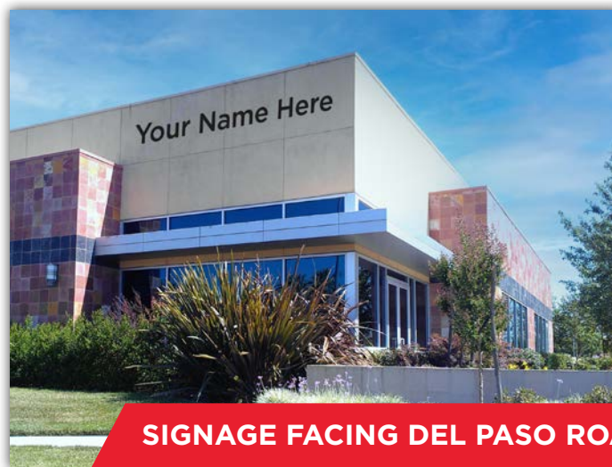
SIGNAGE FACING DEL PASO ROAD