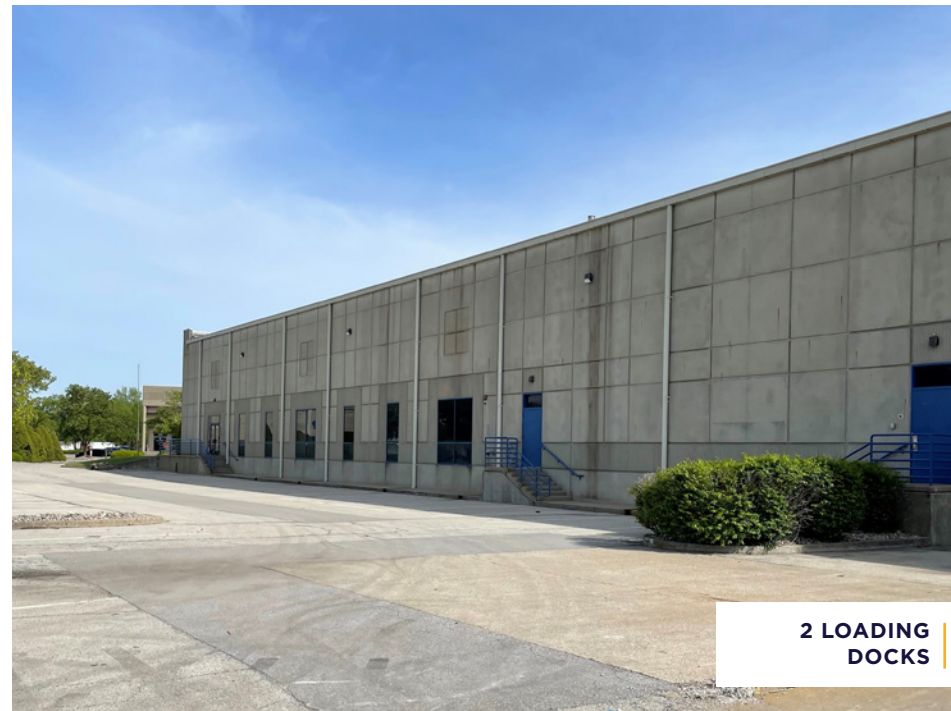
2 LOADING DOCKS