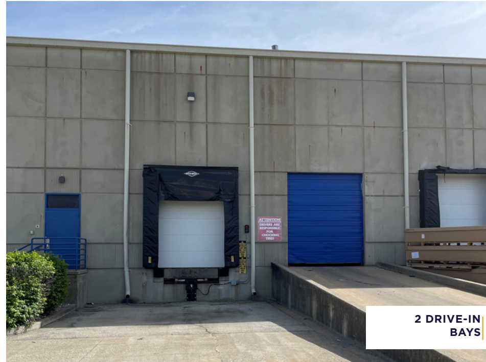
2 DRIVE-IN BAYS

1.3 miles to Ford Truck Plant 1.7 miles to I-265 3.8 miles to I-71