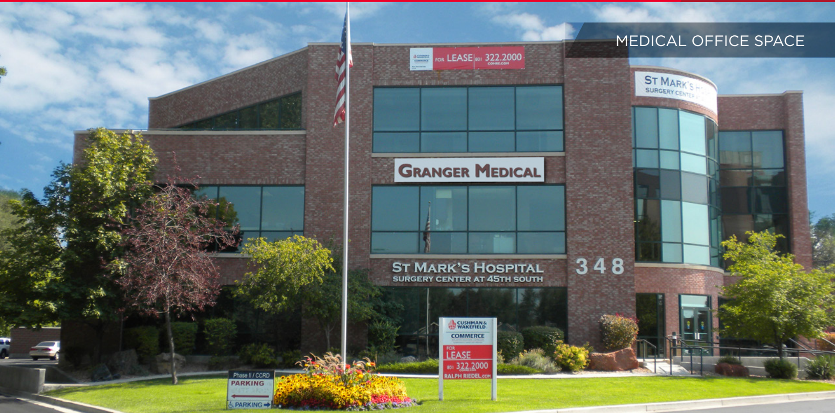
MEDICAL OFFICE SPACE