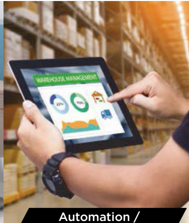
Automation / Advance Solution