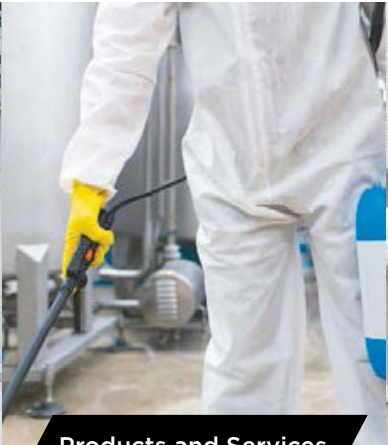
Products and Services