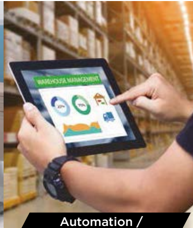
Automation / Advance Solution