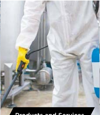
Products and Services