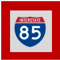
I-85 1.5 Miles