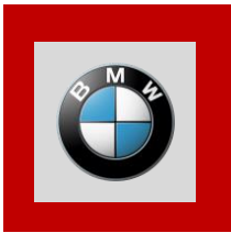
BMW 1 Mile