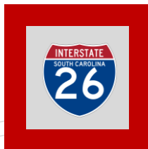
I-26 11.5 Miles