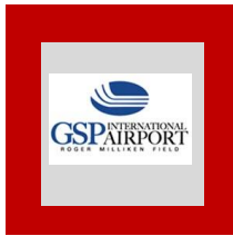
GSP AIRPORT 4 Miles