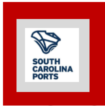
INLAND PORT 2 Miles