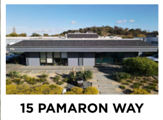
15 PAMARON WAY