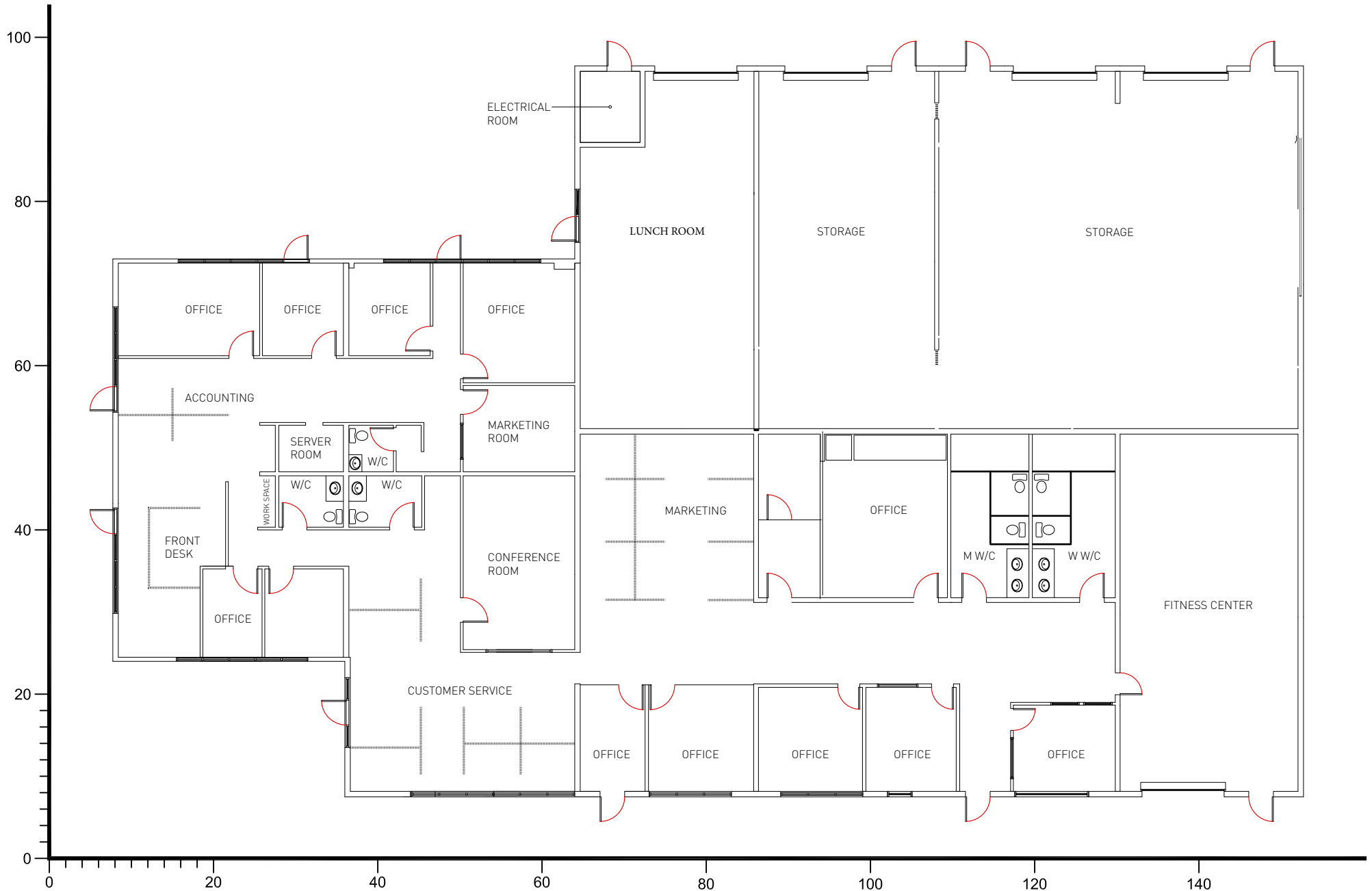
FLOOR PLAN 15 PAMARON WAY - 11,117 sf