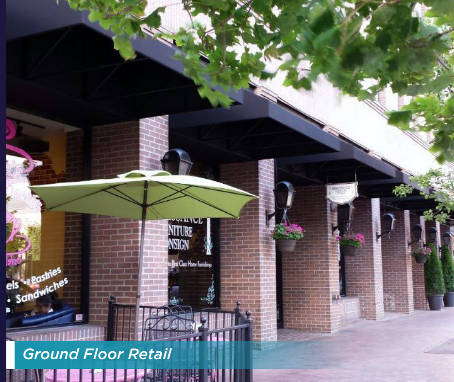
Ground Floor Retail