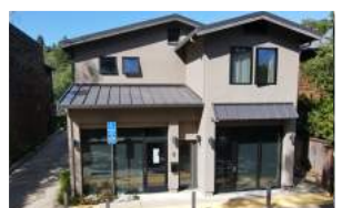
110 E BLITHEDALE