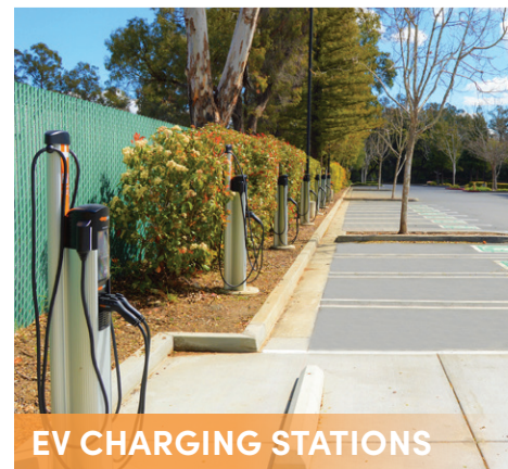
EV CHARGING STATIONS