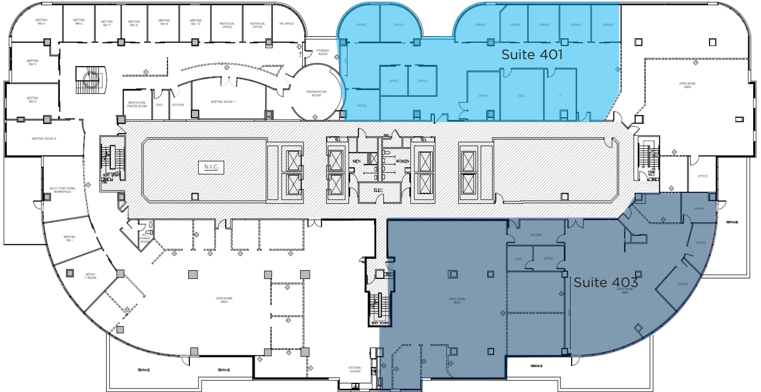
Suite 401 3,995 SF