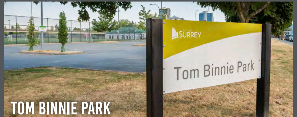
TOM BINNIE PARK