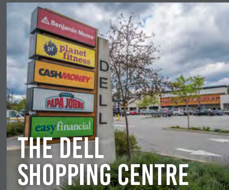
THE DELL SHOPPING CENTRE