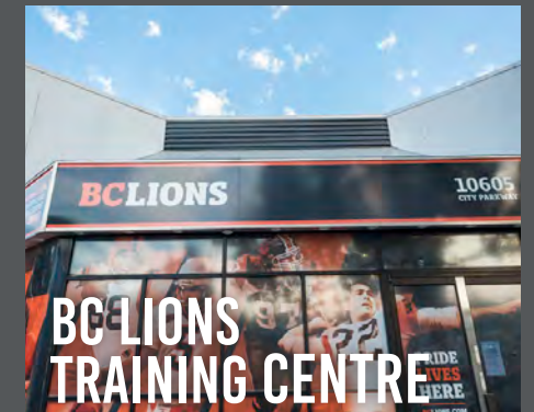
BC LIONS TRAINING CENTRE