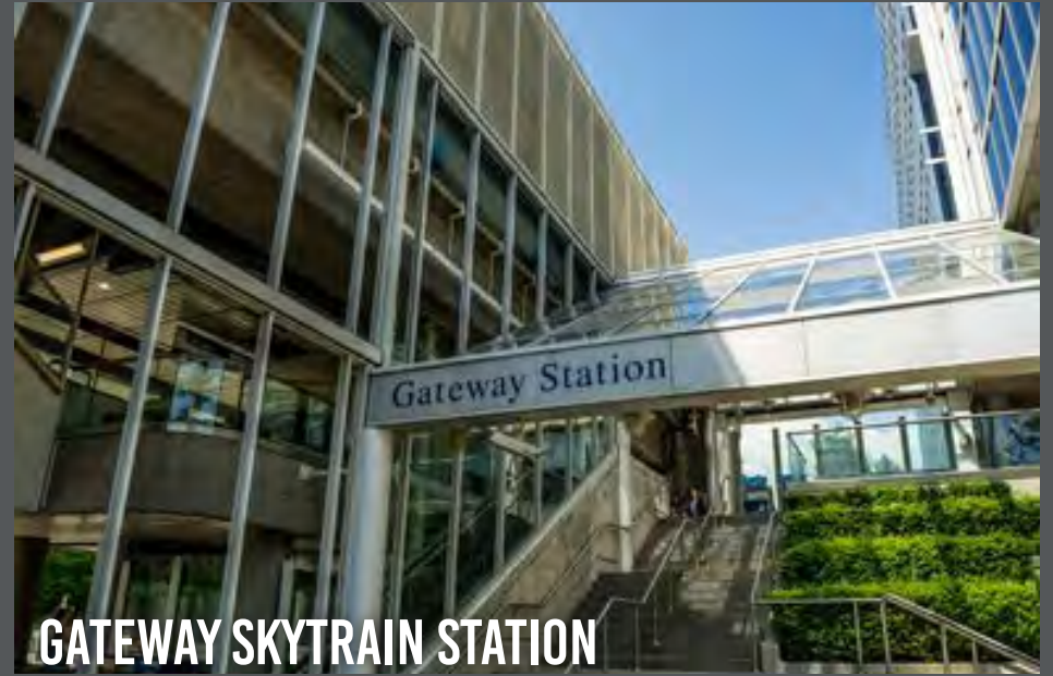
GATEWAY SKYTRAIN STATION