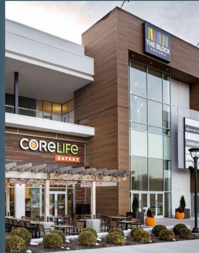
THE BLOCK AT NORTHWAY