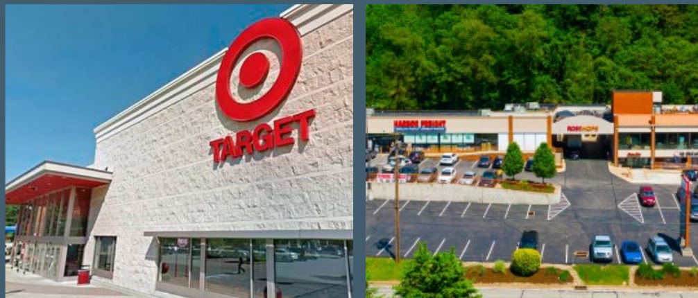
MULTIPLE SHOPPING PLAZA OPTIONS