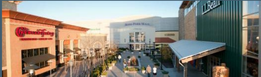
ROSS PARK MALL

The parcels are along McKnight road and seconds away from the region's most sought-after retail—Ross Park Mall and the Block at Northway. Given the proximity to McKnight Road and McCandless, the parcels are a major opportunity to develop and be in the company of some of the region's best access to shopping, dining, medical services while sitting ten minutes from Downtown Pittsburgh.