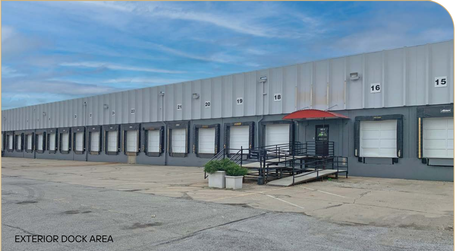
EXTERIOR DOCK AREA