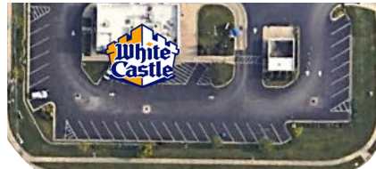
HIGHLAND POINTE DR