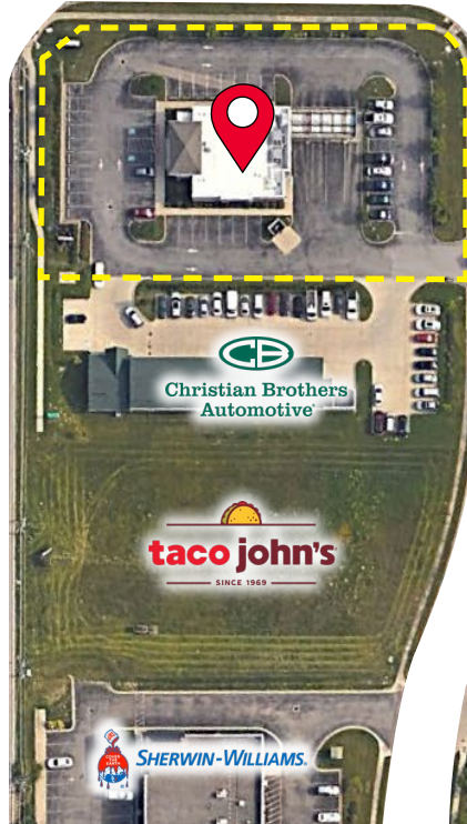
HIGHLAND POINTE DR