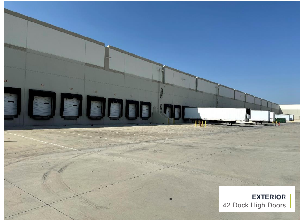
EXTERIOR 42 Dock High Doors