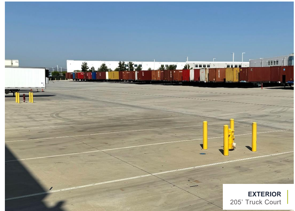
EXTERIOR 205' Truck Court