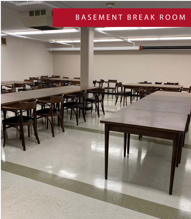
BASEMENT BREAK ROOM