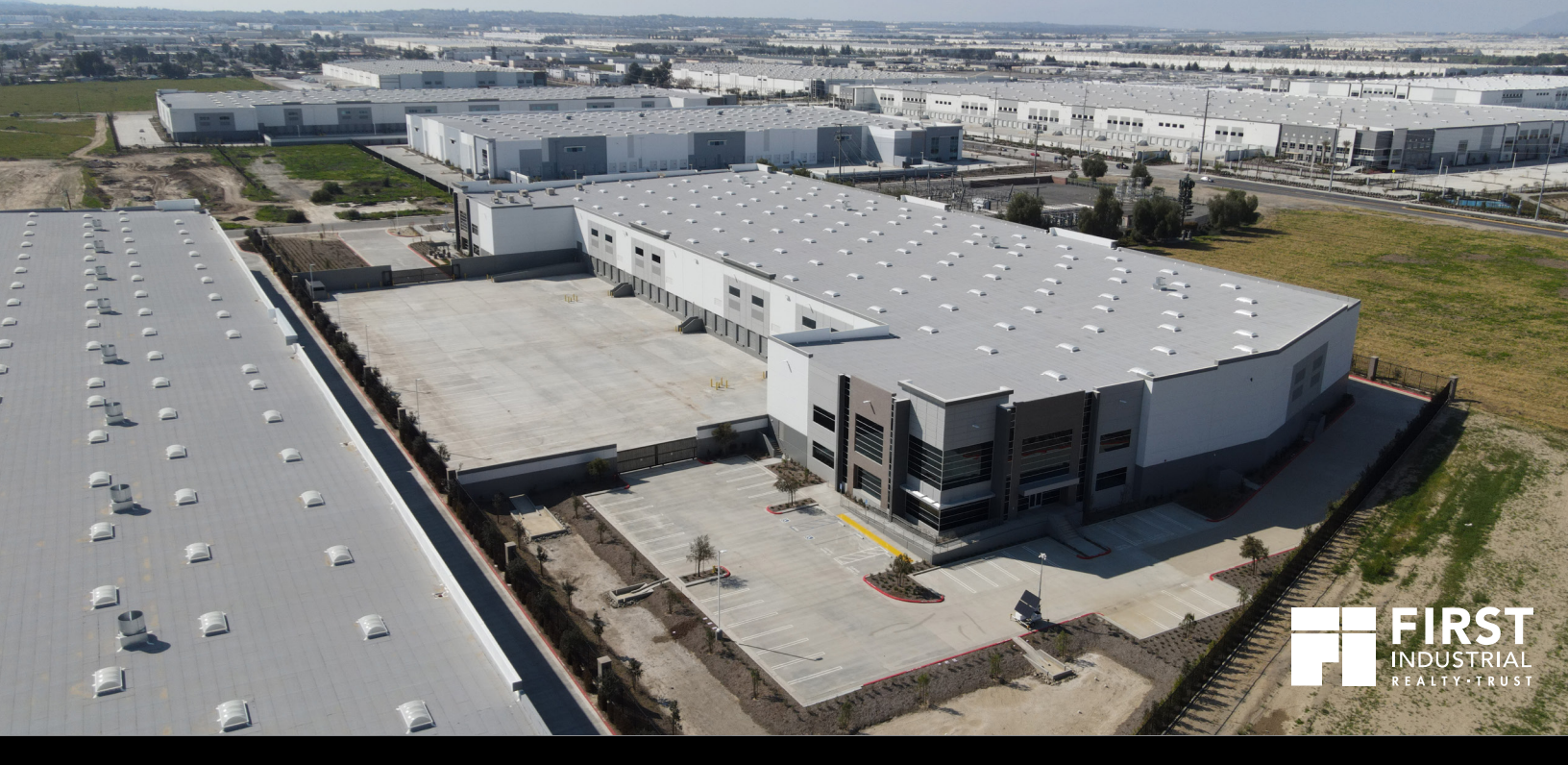
First Wilson II • 3175 Wilson Avenue • Perris, CA