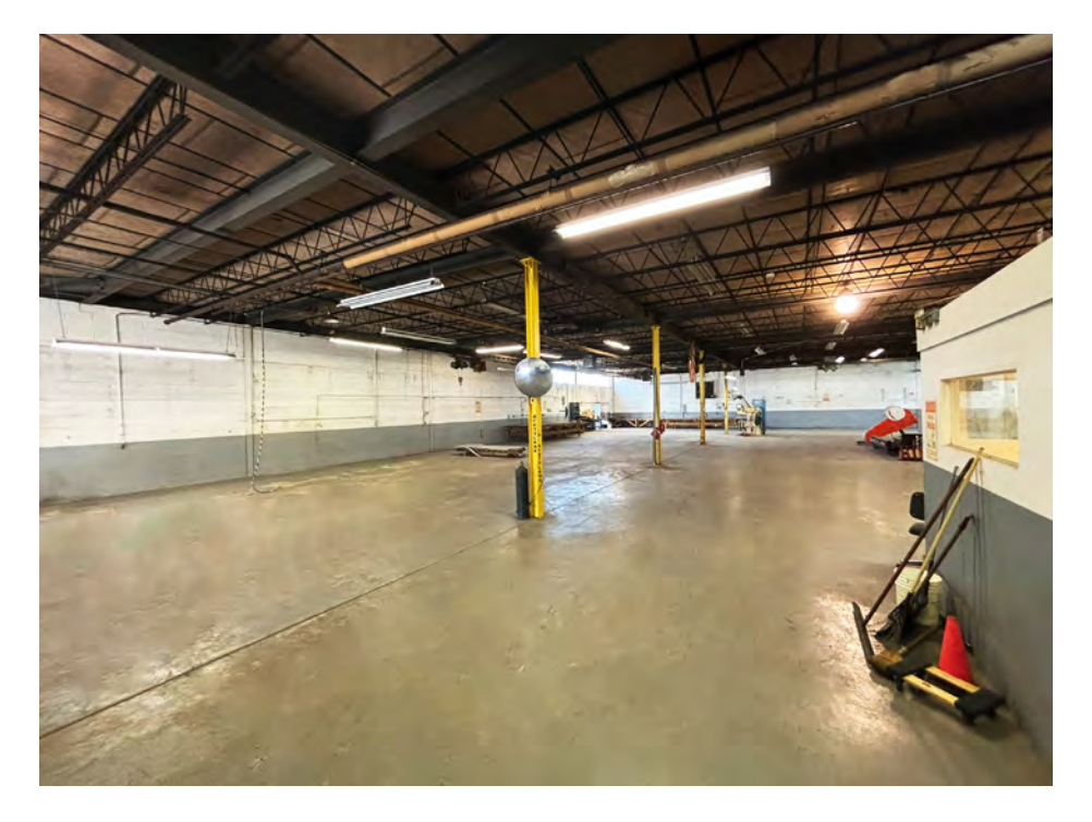
FOR SALE | 6025 SOUTH NEW ENGLAND AVENUE, CHICAGO, ILLINOIS