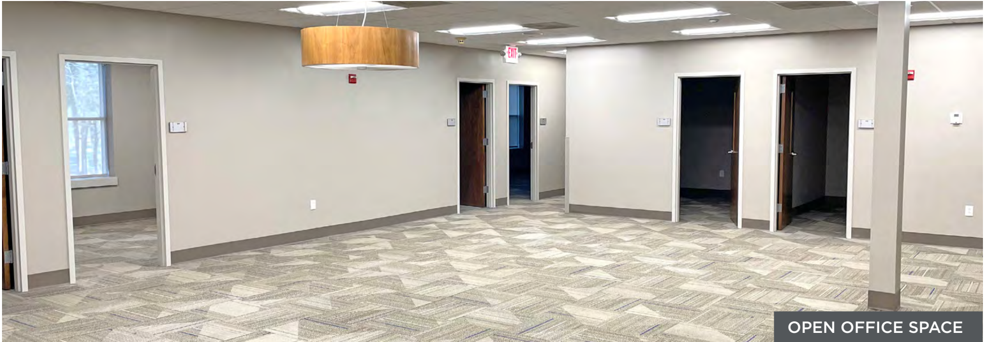
OPEN OFFICE SPACE