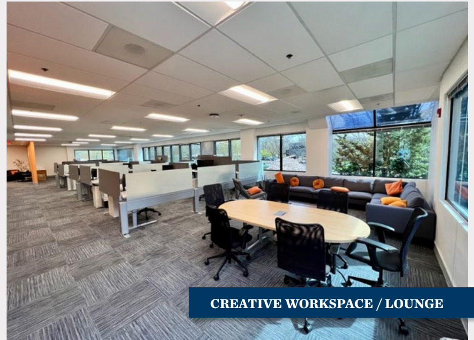
CREATIVE WORKSPACE / LOUNGE