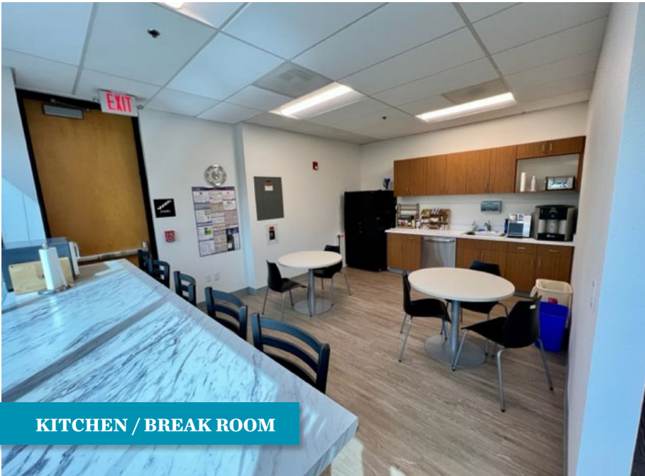
KITCHEN / BREAK ROOM