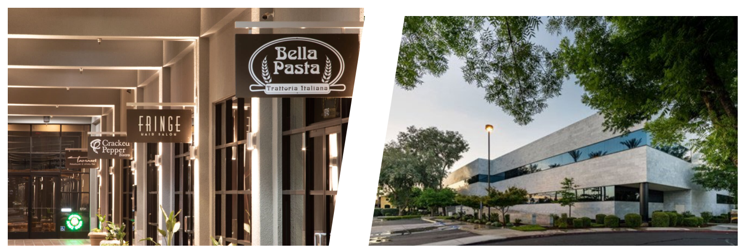
Cushman & Wakefield Copyright 2022. No warranty or representation, express or implied, is made to the accuracy or completeness of the information contained herein, and same is submitted subject to errors, omissions, change of price, rental or other conditions, withdrawal without notice, and to any special listing conditions imposed by the property owner(s). As applicable, we make no representation as to the condition of the property (or properties) in question.