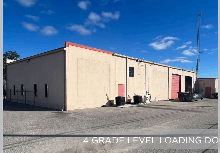
4 GRADE LEVEL LOADING DOORS

©2024 CUSHMAN & WAKEFIELD. ALL RIGHTS RESERVED. THE INFORMATION CONTAINED IN THIS COMMUNICATION IS STRICTLY CONFIDENTIAL. THIS INFORMATION HAS BEEN OBTAINED FROM SOURCES BELIEVED TO BE RELIABLE BUT HAS NOT BEEN VERIFIED. NO WARRANTY OR REPRESENTATION, EXPRESS OR IMPLIED, IS MADE AS TO THE CONDITION OF THE PROPERTY (OR PROPERTIES) REFERENCED HEREIN OR AS TO THE ACCURACY OR COMPLETENESS OF THE INFORMATION CONTAINED HEREIN, AND SAME IS SUBMITTED SUBJECT TO ERRORS, OMISSIONS, CHANGE OF PRICE, RENTAL OR OTHER CONDITIONS, WITHDRAWAL WITHOUT NOTICE, AND TO ANY SPECIAL LISTING CONDITIONS IMPOSED BY THE PROPERTY OWNER(S). ANY PROJECTIONS, OPINIONS OR ESTIMATES ARE SUBJECT TO UNCERTAINTY AND DO NOT SIGNIFY CURRENT OR FUTURE PROPERTY PERFORMANCE.