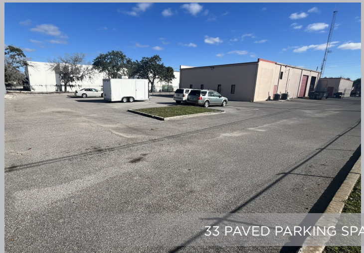
33 PAVED PARKING SPACES