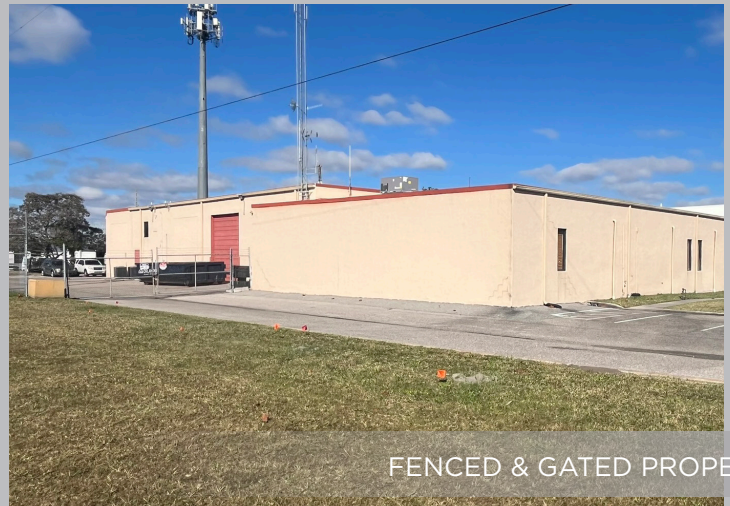
FENCED & GATED PROPERTY