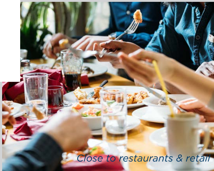
Close to restaurants & retail