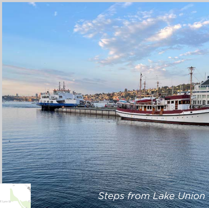
Steps from Lake Union