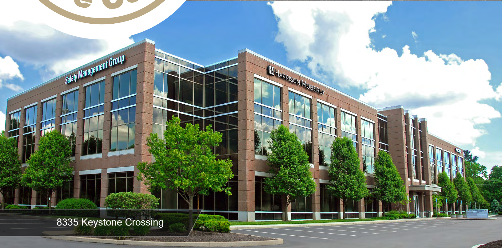
8335 Keystone Crossing