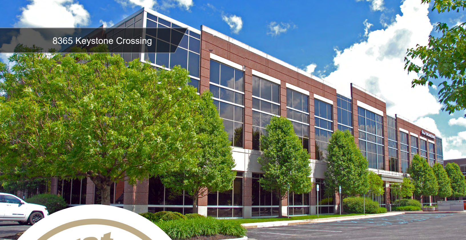
8365 Keystone Crossing