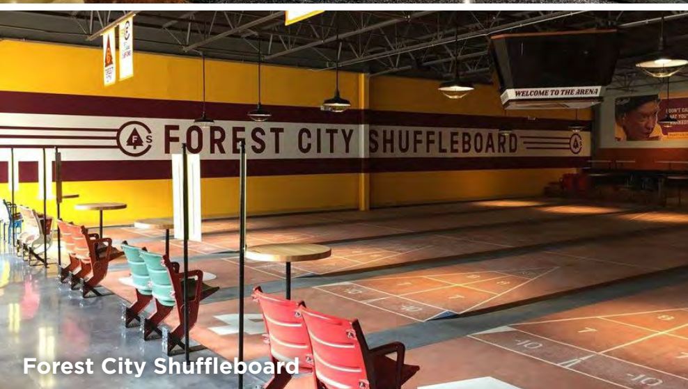
Forest City Shuffleboard