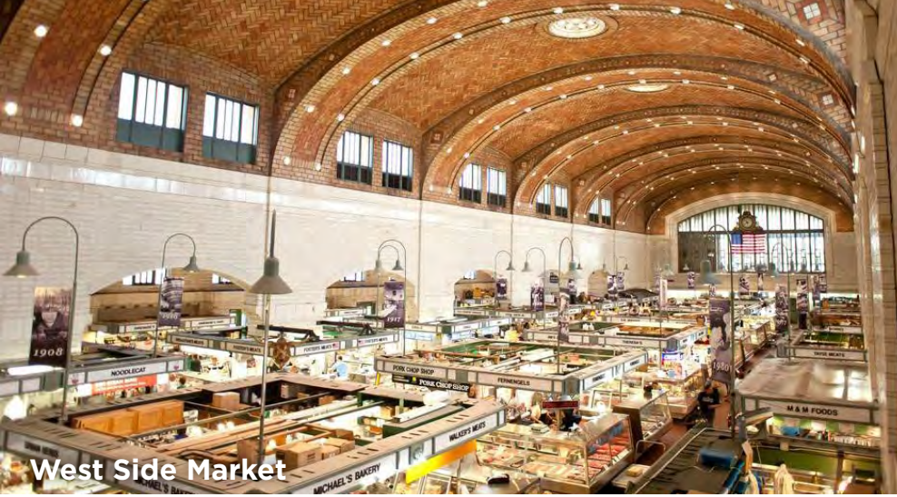
West Side Market