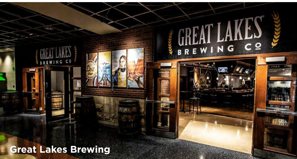
Great Lakes Brewing