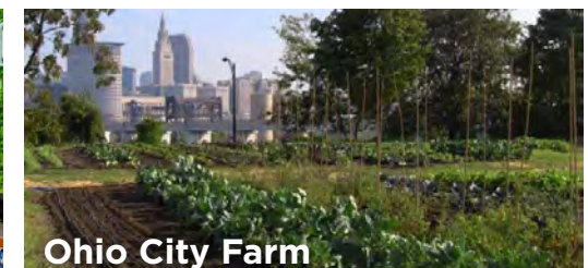
Ohio City Farm