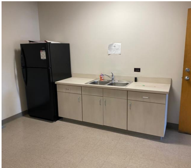
OFFICE & DOCK AREAS