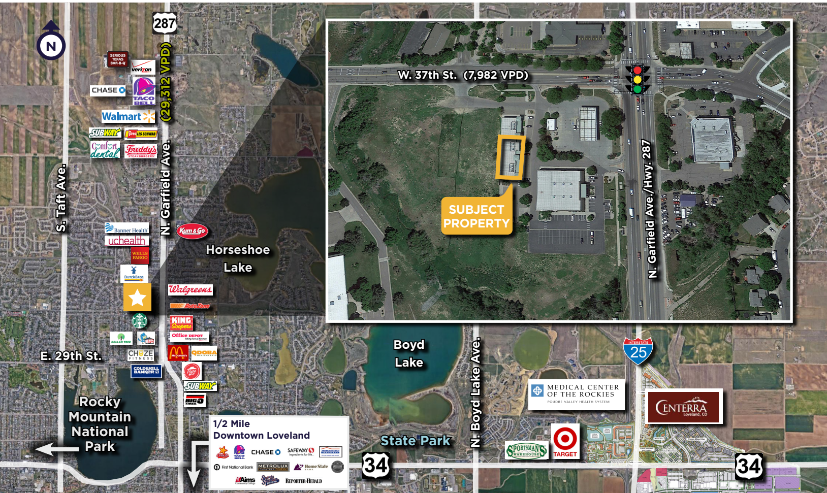
For reference only - not current layout