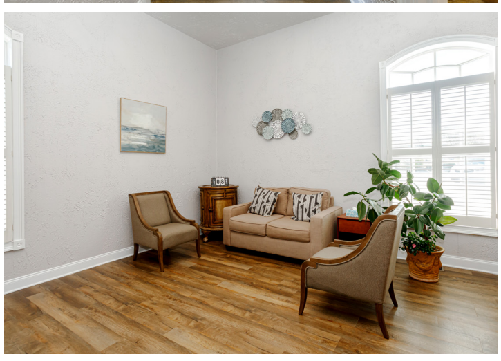
©2024 Cushman & Wakefield. All rights reserved. The information contained in this communication is strictly confidential. This information has been obtained from sources believed to be reliable but has not been verified. No warranty or representation, express or implied, is made as to the condition of the property (or properties) referenced herein or as to the accuracy or completeness of the information contained herein, and same is submitted subject to errors, omissions, change of price, rental or other conditions, withdrawal without notice, and to any special listing conditions imposed by the property owner(s). Any projections, opinions or estimates are subject to uncertainty and do not signify current or future property performance.