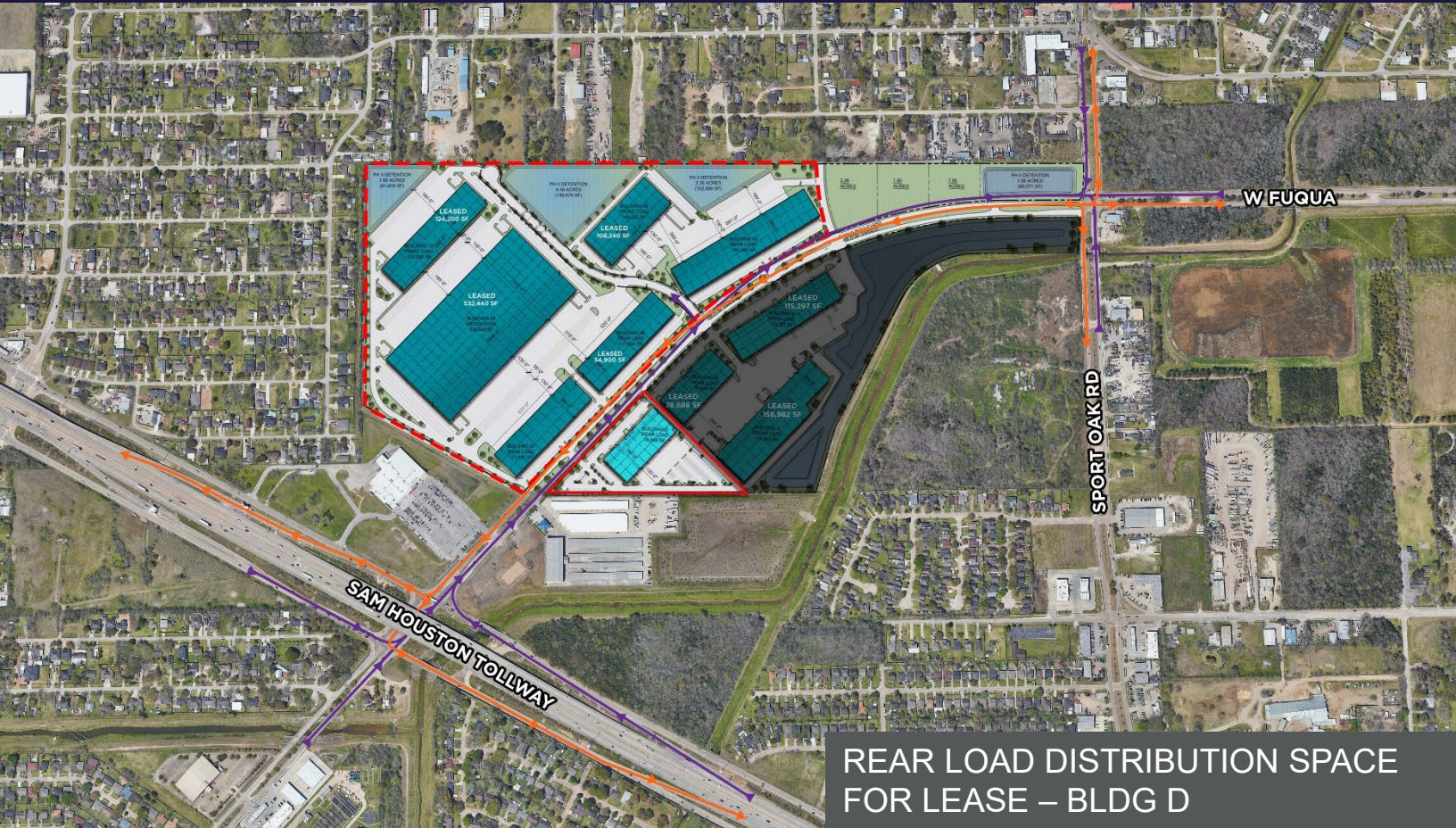
REAR LOAD DISTRIBUTION SPACE FOR LEASE – BLDG D